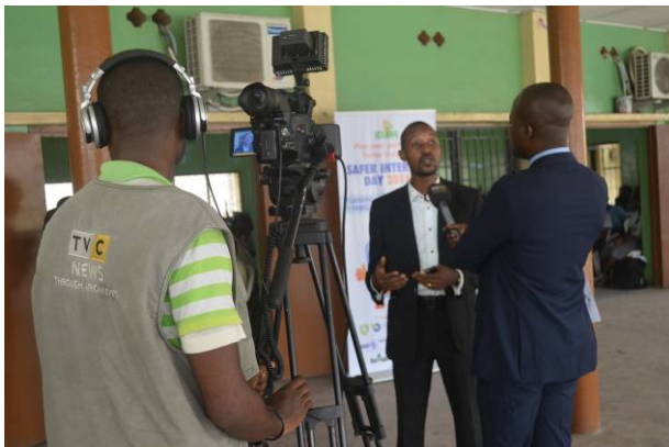
ICLDNG Executive Director been interviewed by the Television Continental (TVC) News