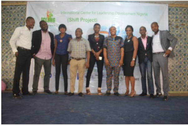
ICLDNG staff and volunteers